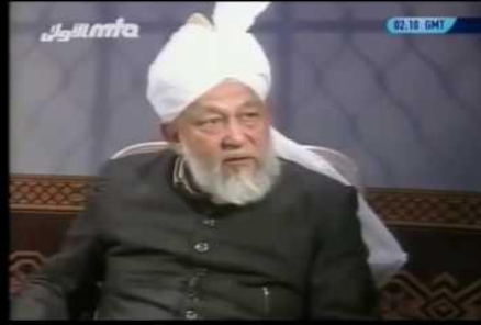
The life of Hazrat Khalifatul Masih the 1 (ra)