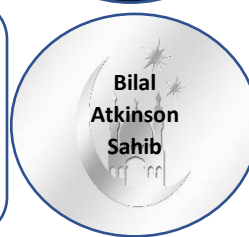
Bilal Atkinson Sahib