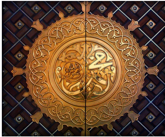
Image: The door of The Prophet's Mosque (Mecca) bearing the blessed name of The Holy Prophet Muhammad (saw) in Arabic

Website: http://www.ahmadiconverts.org.uk Email: newahmadis@ahmadiyyauk.org