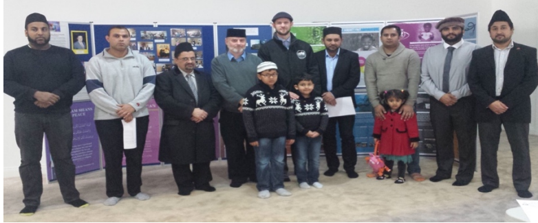
Image: New Ahmadi visit to Hartlepool Jamaat

Syllabus: The syllabus brings together a number of different resources covering Salat (prayers), the foundations of Islamic knowledge and practice, onwards to the revival of Islam during the time of the Promised Messiah (as) . All resources can be accessed online at our website: http://www.ahmadiconverts.org.uk/training-course