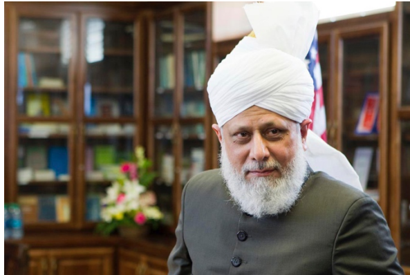
Image: Huzur-e-Aqdas (aba) ( His Holiness ) the Fifth Khalifa (aba)

Medina. The Helpers ( Ansar ) in Medina cared for their new brothers/sisters as if they were family, or closer still. His Holiness, the Khalifa Hadrat Mirza Masroor Ahmad (aba) , has instructed that we should establish the same scheme for new Ahmadis in the community.