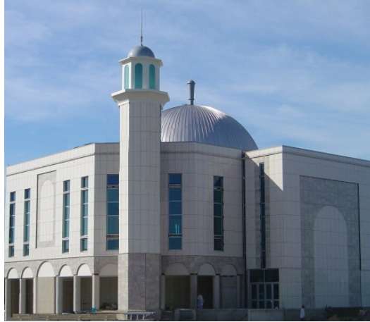
Image: Baitul Futuh mosque, London (largest mosque in Western Europe)