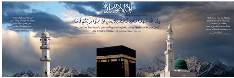
Image: The Holy Kaaba, the Mosque of the Holy Prophet (saw), and the Minaret of the Promised Messiah (as)

God willing ( inshaAllah ). Your local secretary will seek to find the best brother/sister for you ASAP after you have taken initiation ( Bai'at ).