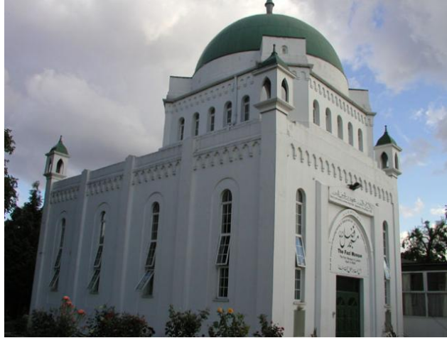
Image: Fazl Mosque, London (Built in 1924 – London's oldest mosque)

thousands of letters every week from Ahmadi Muslims throughout the world. Whilst it may take time for him to reply to your letter, every letter (or a summary) is presented to him and you will receive a reply, inshaAllah. The address is: Hazrat Khalifatul Masih V , The London Mosque, 16 Gressenhall Road, Southfields, London, SW18 5QL.