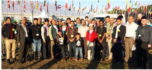
Image: Members of the New Ahmadi delegation, Jalsa Salana 2016

receive assistance through your local presidents/secretaries for both transport to, and accommodation at, Jalsa . (See also our website http://www.ahmadiconverts.org.uk/jalsa/ ).