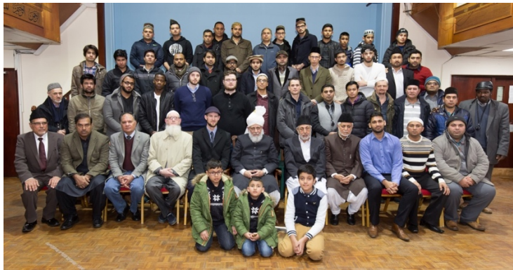
Image: Mulaqat (Meeting) with His Holiness (aba) , the Fifth Khalifa to the Promised Messiah in Fazl mosque, London

It is the way of Allah Almighty that Prophets are followed by Successors (Khulafa). Jesus (as) was followed by Peter. Muhammad (saw) was followed by Abu Bakr (ra) . The Promised Messiah (as) was also followed by Successors ( Khulafa ). His first Khalifa was Hazrat Maulvi Noorudin (ra) . There have been five successors. Currently, His Holiness, Mirza Masroor Ahmad (aba), is the Fifth Khalifa. We are truly blessed that the Khalifa of Islam lives in the UK. We are even more blessed that we are able to meet with him.